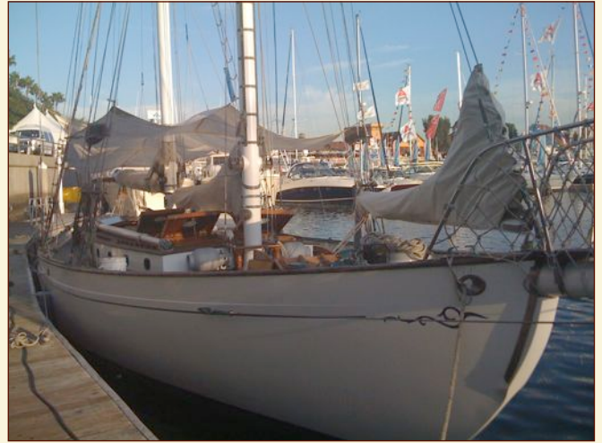
Classic 1947 74' Alden Schooner S/V "Mayan" Re-Splashed in 2005. Captured Imagination at the 2008 Long Beach International Boat Show.

David Crosby's Iconic Wooden Ship, "Mayan", is currently available. Hawai'i Yachts spent four days aboard her with California's Sailboats Inc. Contact Capt. Chad for more details of this special ship. 808.222.9768